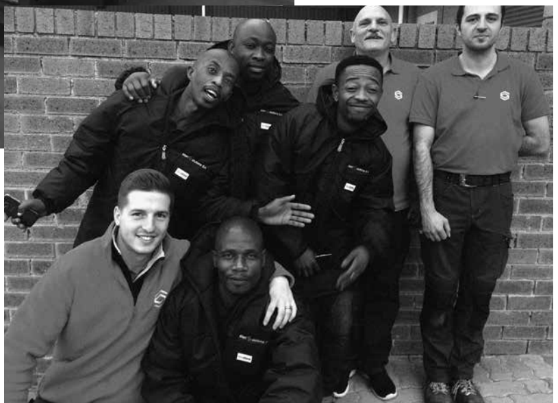
Our Sterimed team meeting the Steri Solutions's staff in South Africa.